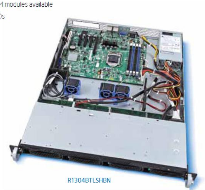
Intel® Server System R1304BTLSHBN Technical Specifications